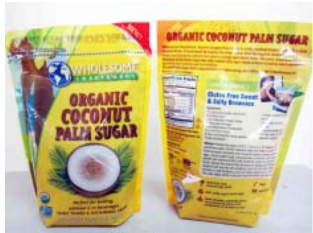
Coconut Palm Sugar - the future hope for diabetic patients