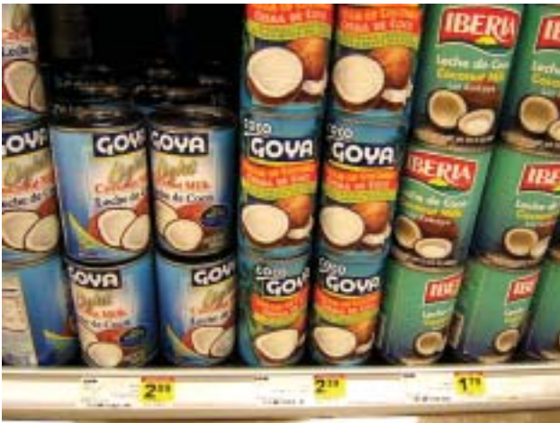
Coconut products for sale in US supermarket