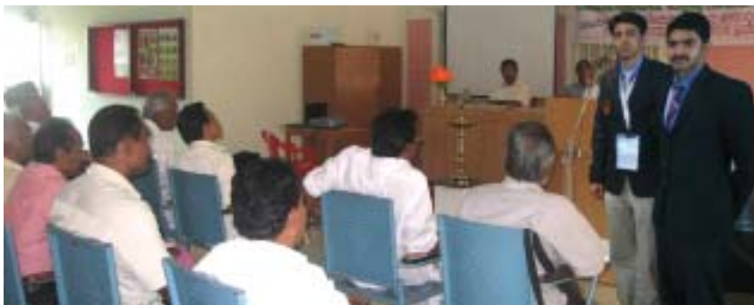
Role of management institutions in developing new market strategy

water in all the 63 cities, we should have at least 150-200 units. We must have at least 96 units for catering to the need of 100% consumers in all metros. At present there are only 2 coconut milk units, 2 coconut milk powder units, 80 desiccated coconut powder units, 17 virgin coconut oil units, more than 100 coconut oil units and only 4 coconut chips manufacturing units. The average coconut productivity of India is 8303 nuts per ha. i.e. 48 nuts per tree. We must accelerate our per palm productivity to 150 nuts per tree for making available the product mix in all the JnNURM cities. This year's export turnover of coconut products have crossed Rs. 837 crores. This increase is from a very low level of Rs.6 crores in 2004. India too can compete in the world market if we can make our export turn over at Rs.5,000 crores by the end of this Five Year Plan period.