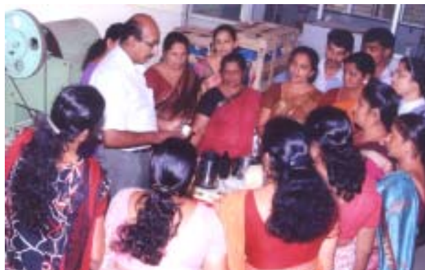
Training programmes in progress at TDC, Vazhakkulam

The main objective of the Technology Development Centre of the Coconut Development Board located at South Vazhakulam, Aluva, Kerala is to promote the overall development and growth of coconut based industries in the country. The activities carried out in TDC area as follows-