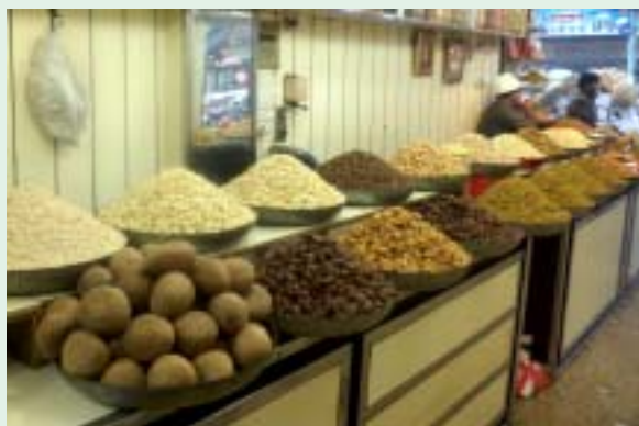
Ball Copra displayed for sale in Khari Bhoti market, New Delhi

The retail price of ball copra commonly known as Bombay copra, Tiptur copra etc, ranges from Rs.80 to 110 per Kg where the value addition is 8-12 times. This premium