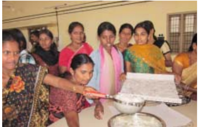
The women SHG get trained in coconut chips making

Coconut Development Board, DSP Farm Mandya and Department of Horticulture, Government of Karnataka jointly conducted one day training programme in coconut chips manufacturing at Coconut Processed Products Demonstration-cum Training