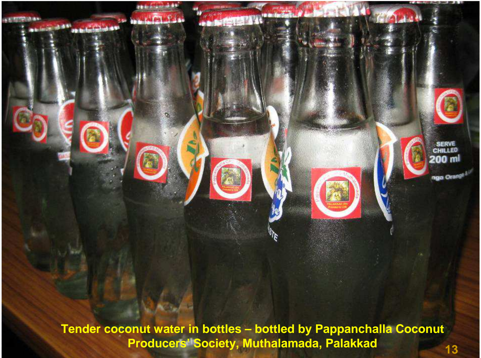
Tender coconut water in bottles – bottled by Pappanchalla Coconut Producers' Society, Muthalamada, Palakkad