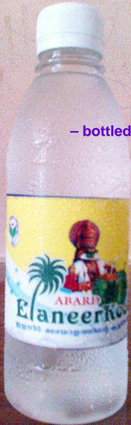
Tender coconut water in bottles – bottled by ABARD Nanniyode, Thiruvananthapuram